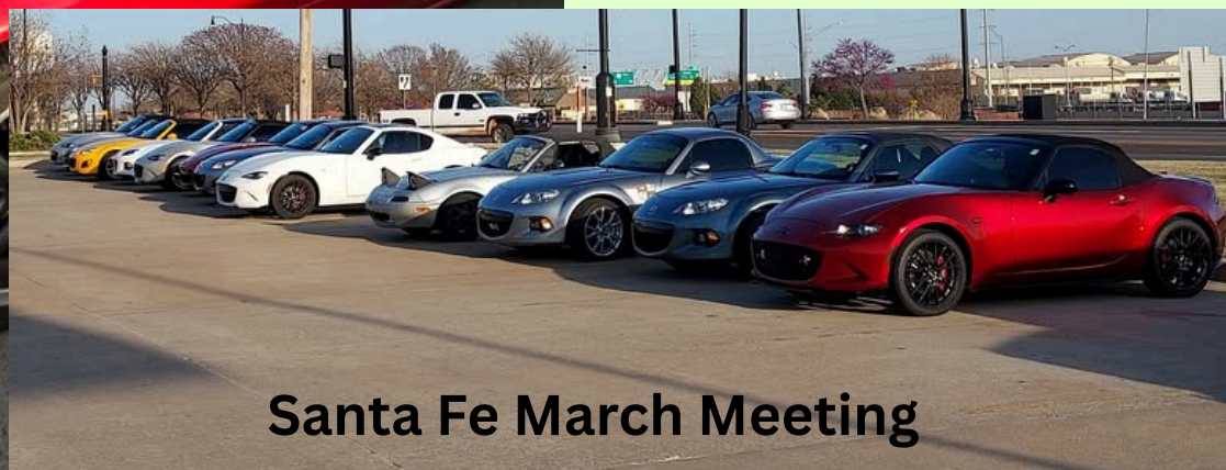
Santa Fe March Meeting